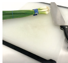
Food Prep Surfaces