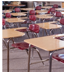
Desks and Table Tops