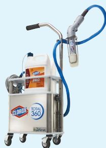
1 Unit UPC: 60010