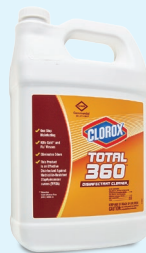
4/128 oz. Gallon UPC: 31650