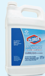
4/128 oz. Gallon UPC: 31651