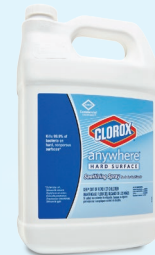
4/128 oz. Gallon UPC: 31651