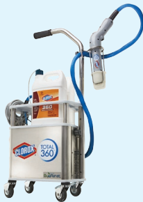
1 Unit UPC: 60010

Each surface is uniformly coated with solution.