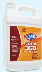
4/128 oz. Gallon UPC: 31650